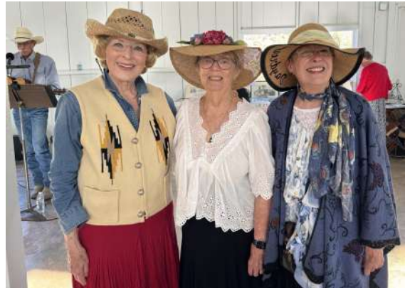
140 th ANNIVERSARY CELEBRATION PHOTOS