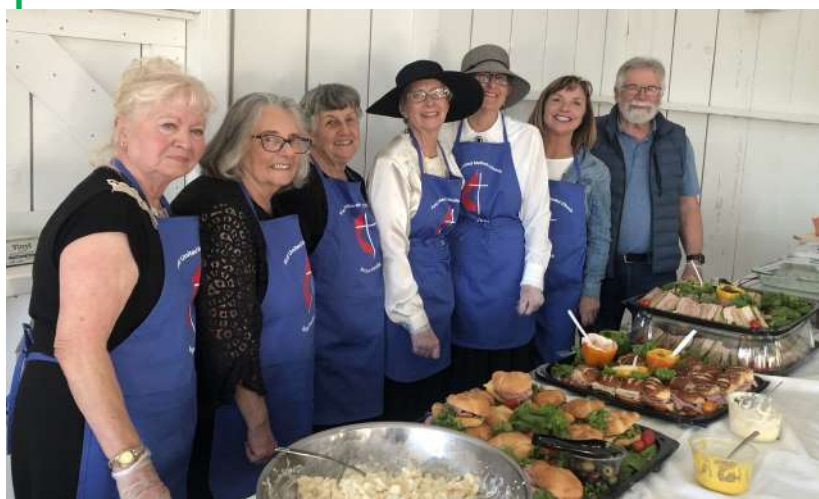
140 TH ANNIVERSARY CELEBRATION PHOTOS