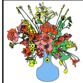
Flowers This Week

Thank you to our church family for all of the giving and support with 2010 Vacation Bible School.