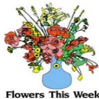
Flowers This Week

Look for the Calendar in Criswell Hall to list your dedication.