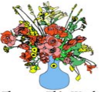
Flowers This Week

Look for the Calendar in Criswell Hall to list your dedication.