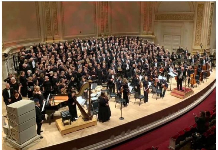
STERN AUDITORIUM PERELMAN STAGE CARNEGIE HALL